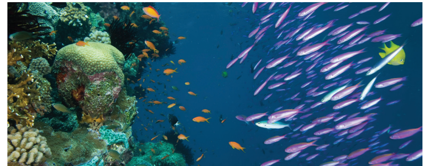
Great Barrier Reef, Australia

More information can be found at www.keybiodiversityareas.org