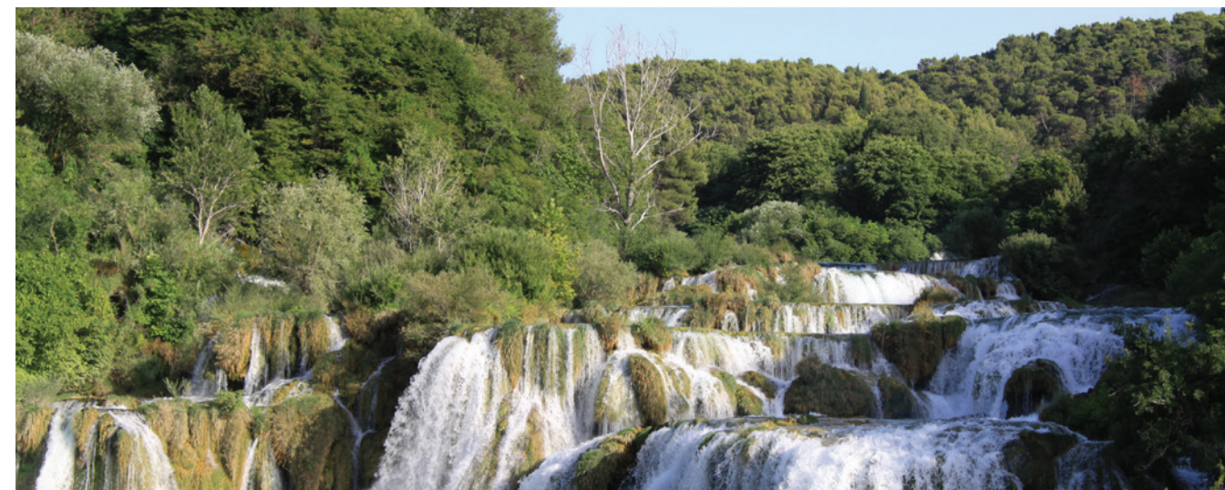
Krka National Park, Croatia