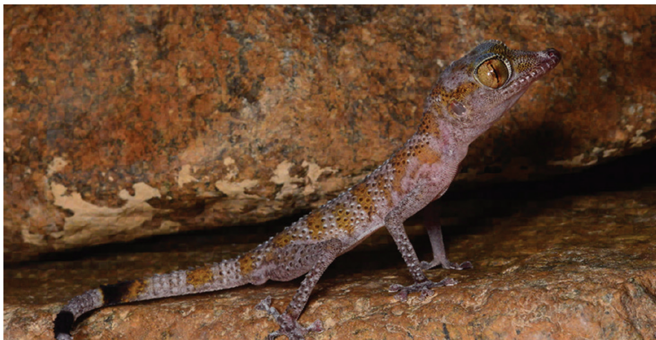
Emirati leaf-toed gecko ( Asaccus caudivolvulus ) is restricted to a small coastal area of the United Arab Emirates