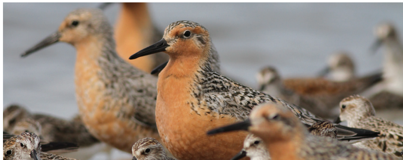
Red Knots ( Calidris canutus , NT) aggregate during migration