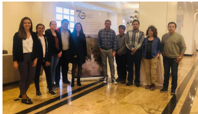
Photo 2 and 3: Key Biodiversity Areas workshops in April 2019 in Bogota and Quito.

In Paraguay, the BirdLife International Partner (Guyra Paraguay), WCS Paraguay and WWF Paraguay have joined the Ministry of the Environment and Sustainable Development to advance the official recognition of KBAs and begin establishing the National Coordination Group (NCG). The event was attended remotely by the IUCN and NatureServe whose representatives kindly shared the experience gained in the Tropical Andes with KBA-related training events.